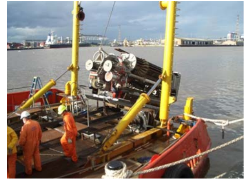
Trial Launch of PROD on MV Mermaid Raider

The site investigation was conducted to understand the likely soil behaviour under spudding and pre-loading for the Ensco 102 jack-up drilling rig. Of particular interest in the investigation was the behaviour of the soil to cyclic loading.